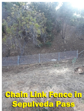
Chain Link Fence in Sepulveda Pass

Building and maintaining an Eruv is a delicate balance between permanence and flexibility. On the one hand, we need a perimeter with enough “give” that it can be adjusted on minimal notice week by week in response to the changing environment. On the other hand, the eruv has to be constructed to last for decades.