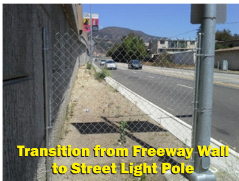
Transition from Freeway Wall to Street Light Pole

Over this past year we have replaced or installed numerous new segments of chain link fencing.