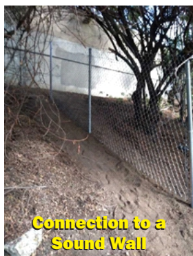
Connection to a Sound Wall

Along major sections of our freeway boundaries, we have rerouted our primary mechtza from CalTrans chain link fencing, beginning the long-term process of upgrading onto new solid block sound walls. To do so we have had to install many connecting fences to create transitions onto and off of the sound walls. Each of these fences has to be built and installed to CalTrans specifications with proper concrete footings and materials.