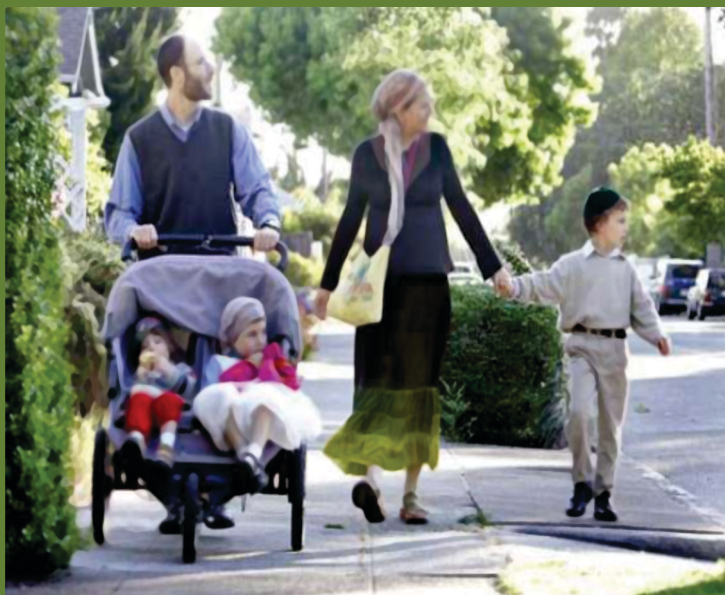
Photograph Used With Permission.