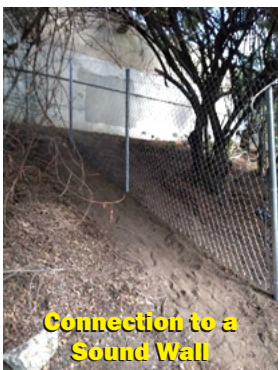
Connection to a Sound Wall

We are rerouting our primary mechitza from CalTrans chain link fencing, beginning the long-term process of upgrading onto new solid block sound walls.