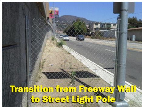
Transition from Freeway Wall to Street Light Pole

Over this past year we have replaced or installed numerous new segments of chain link fencing.