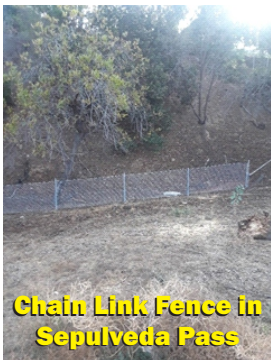
Chain Link Fence in Sepulveda Pass

Building and maintaining an Eruv is a delicate balance between permanence and flexibility. On the one hand, we need a perimeter with enough “give” that it can be adjusted on minimal notice week by week in response to the changing environment. On the other hand, the eruv has to be constructed to last for decades.